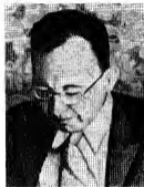
5. G. Ya. Levenfish